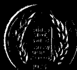
INDIA - 1973 50 paise Ears of wheat