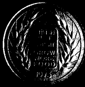
INDIA 20 rupees - 1973 Ears of wheat