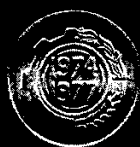
ALGERIA 5 centimes - 1974 Four -year Plan