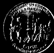
THAILAND 1 baht - 1972 Ploughing Ceremony