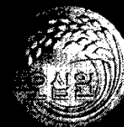
KOREA 50 won - 1973 Rice