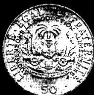
HAITI 50 centimes - 1972 'Grow More Food'